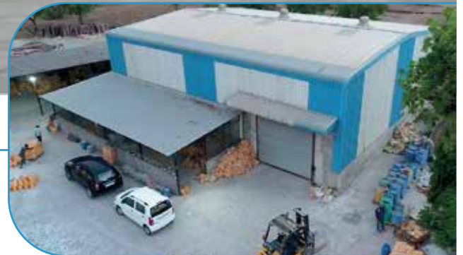
Unit II - Bhiwandi ▶

Astra Concrete Products , a partnership firm established in 1996, is the largest manufacturer and exporter of pre-cast concrete products in India. Based in Goa India, Astra is reputed for manufacture and supply of high strength fiber reinforced concrete cover blocks. Astra fiber concrete cover blocks are available all major cities of Western and Southern India.