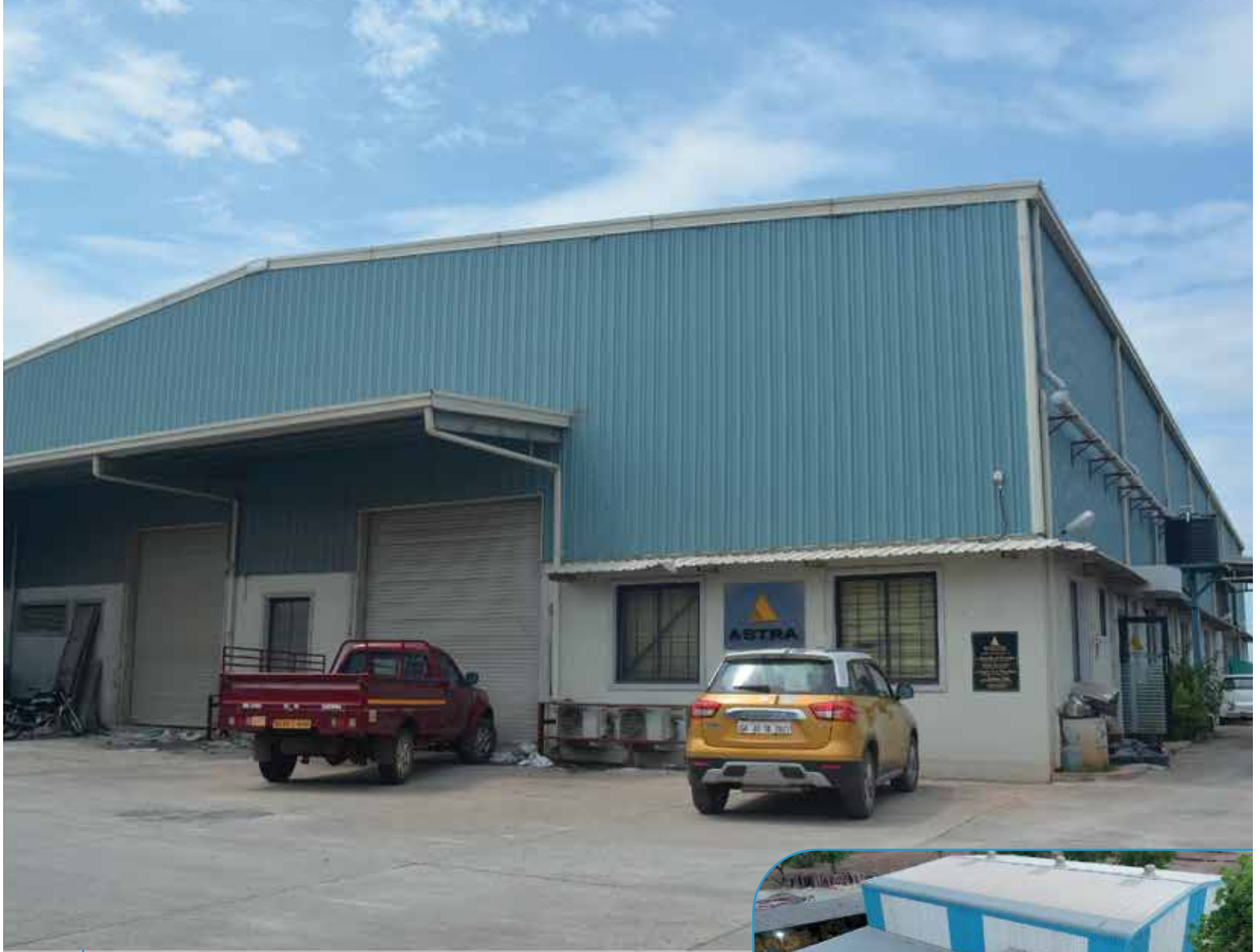
▲ Unit I - Goa