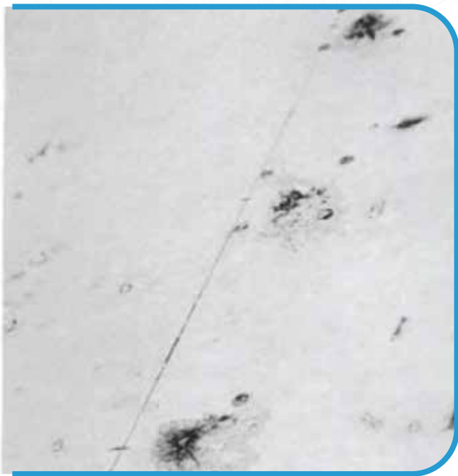
Ferry quay West Coast of Norway, built 1988 Corrosion at the location of the plastic spacer Photograph taken in 1997